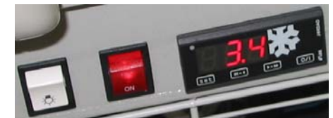
Light Switch Power Switch Controller and Temperature display